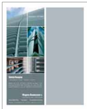
1/2 page, 96 x 243 mm. DKK 20.600