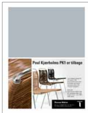
1/2 page, 195 x 127 mm. DKK 20.600