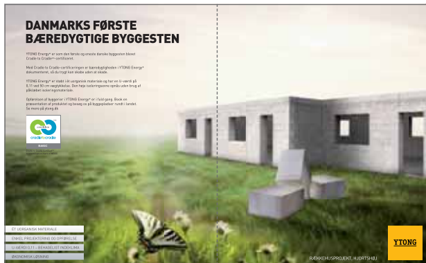
2/1 pages, 460 x 297 mm. DKK 51.400