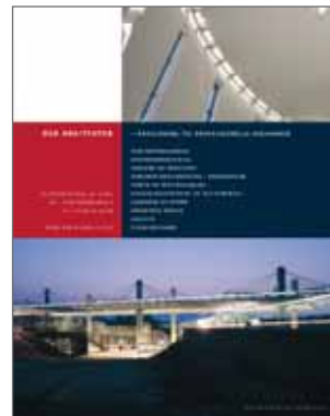
1/1 page, 230 x 297 mm. DKK 32.500